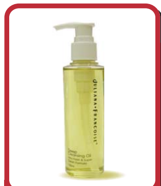
Deep Cleansing Oil