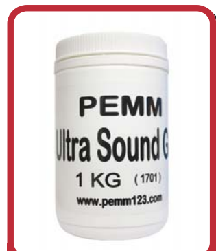
Ultra Sound Gel