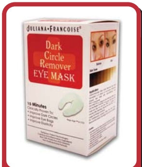
Dark Circle Remover Eye Mask