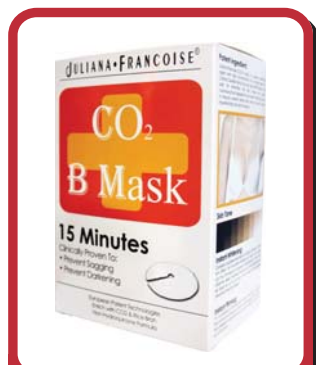
CO2 B Mask