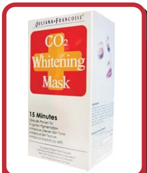
CO2 Whitening Mask