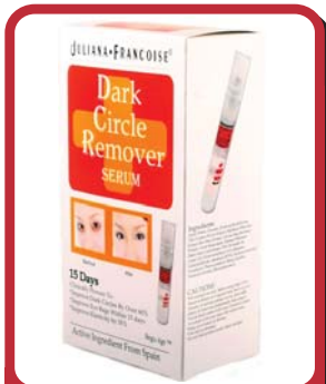
Dark Circle Remover Serum